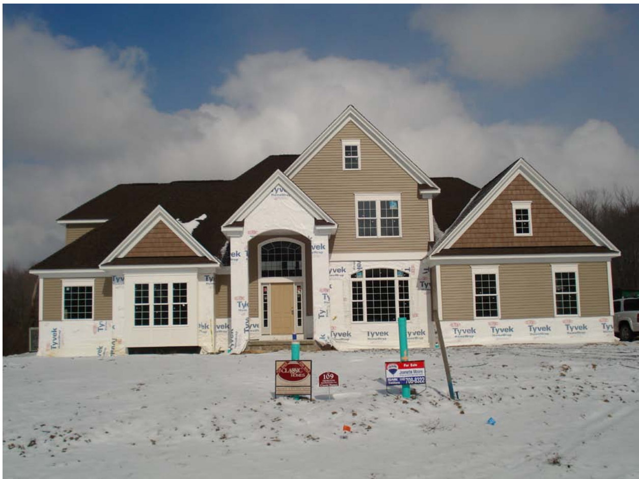
Figure 1 – Colonial Home Used as Model for Sprinkler Contractor Bids

A local builder provided the use of a model home to obtain bids for the installation of a residential sprinkler system (see figure 1). This home represented a typical modern residence being constructed in the City of Aurora. The home is a 3,150 sq/ft. 4-bedroom two-storey modern colonial that had just completed framing and enclosure at the time of this study. It is located in a new sub-division served by the municipal water system. The cost of construction was reported by the builder to be $133 sq/ft. totaling $558,950.